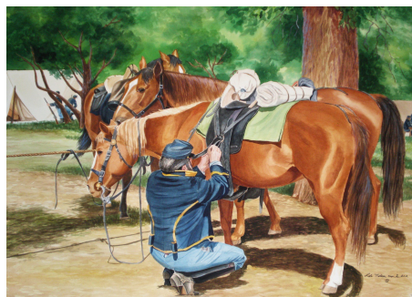
"Checking the Cinch" watercolor by Lola Nelson