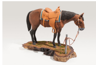
"A Time to Rest" wood carving by Lola Nelson