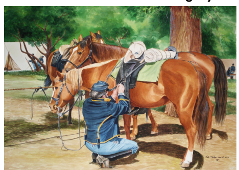
"Checking the Cinch" watercolor by Lola Nelson