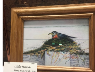
Best of Show 2018 Mini Show